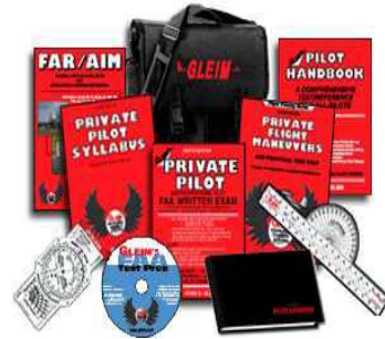
Gleim Private Pilot Kit