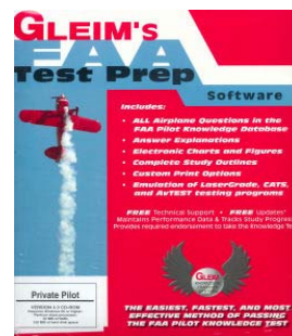
Gleim Written Test Software