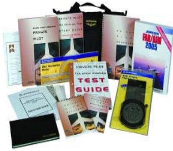
Jeppesen Private Pilot Kit

Below are the top Private Pilot kits and other resources for your private pilot training: