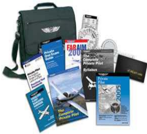
ASA Private Pilot Kit